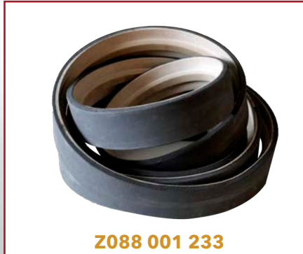
DYNAMIC Ball Lift Belt