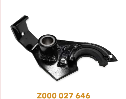
Assy. Bearing Support Even 10-Pin