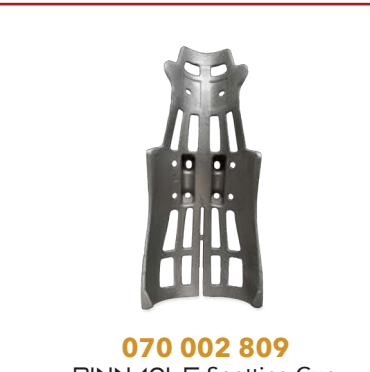
PINN/CLE Spotting Cup