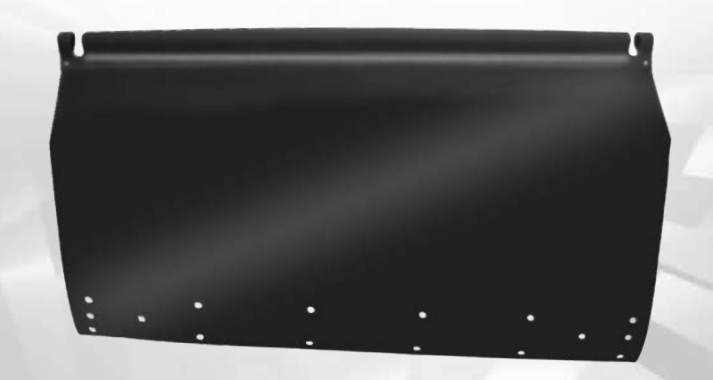
PINN/CLE Solid State Switch Backend