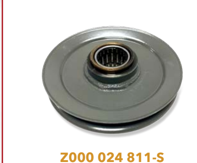
Steel Clutch Pulley w/Bearing Even Machine