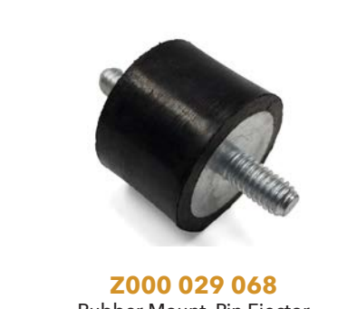
Rubber Mount, Pin Ejector