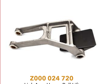
Link Assy Upper Ball Lift