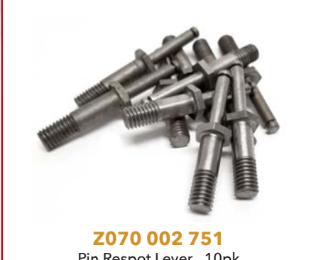
Pin Respot Lever 10pk